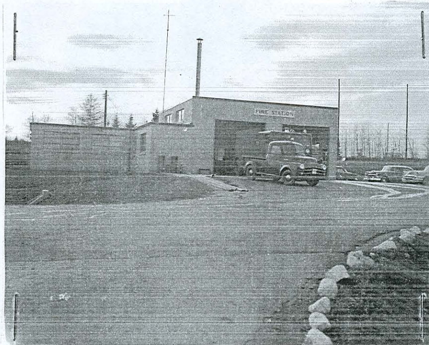
View taken on 30 October 1956