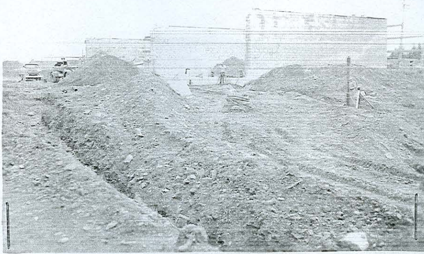
Construction was started on 17 April 1956 View taken on 11 July 1956